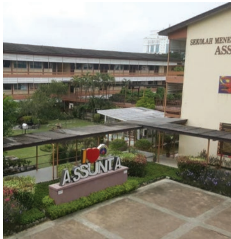
Assunta Girls' School ▲

However, many residents who witnessed the growth of this district feel that it is important to avoid overpopulation and overdevelopment in order to preserve the special and nostalgic ambience of this district.