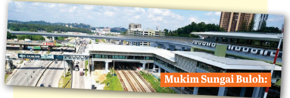
Mukim Sungai Buloh: