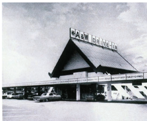
▲ A&W located in the heart of Petaling Jaya

To better understand the life in the Petaling District, we went down to the four mukim (sub-districts) to interview everyday people on their experience on living in the Petaling District. This is what some of them had to say: