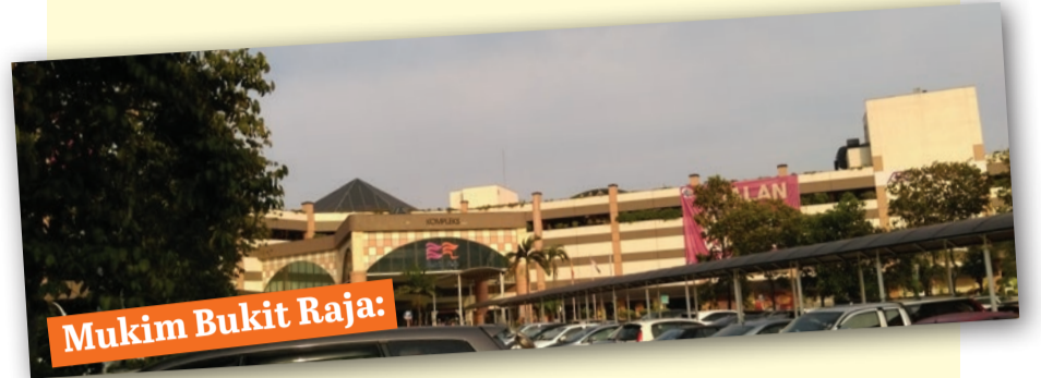
Mukim Bukit Raja:

To better understand the life in the Petaling District, we went down to the four mukim (sub-districts) to interview everyday people on their experience on living in the Petaling District. This is what some of them had to say: