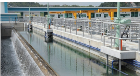
Water supply from Sungai Langat treatment plant restored Page 3

19 June 2018 began a brand-new era for Selangorians as they heralded a new Menteri Besar for Selangor. The successor to Dato' Seri Mohamed Azmin Ali was revealed to be a young and vibrant candidate by the name of Amirudin Shari, the second youngest candidate to ever hold the position of Selangor Menteri Besar. Story continues on Page 4