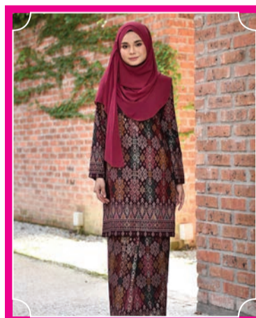
◀ Baju Kurung

The Portuguese-Eurasian community of Malacca also has a traditional dress of its own. Dating back to the early 1500s, the Malaccan Portuguese traditional costume is reminiscent of European folk dress. Black and red dominate the colour scheme of these traditional costumes. The women wear