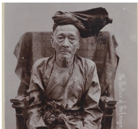
▲ Raja Abdul Samad bin Raja Abdullah

With this advantage, as well as its rich flora and fauna, the settlement in Selangor greatly flourished, and it helped to establish trade relations with the outside world. This is evidenced by the discovery of several artifacts such as the Dong S'on bronze drum in Kampung Sungai Lang, Kuala Langat and Bukit Kuda, Klang and three bronze bells that were found in Klang.