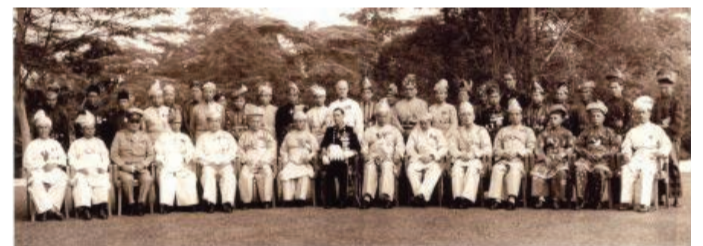
▲ The Malay Rulers with Sir Donald MacGillivray on 5 August 1957 after the Federation of Malaya Agreement-Signing Ceremony.

On 1 February, 1974, an agreement between the Selangor State Government Darul Ehsan and the Federation of Malaysia was signed for the establishment of the Federal Territory of Kuala Lumpur. This meant that Selangor relinquished Kuala Lumpur to the federal government. The Sultan of Selangor commemorated