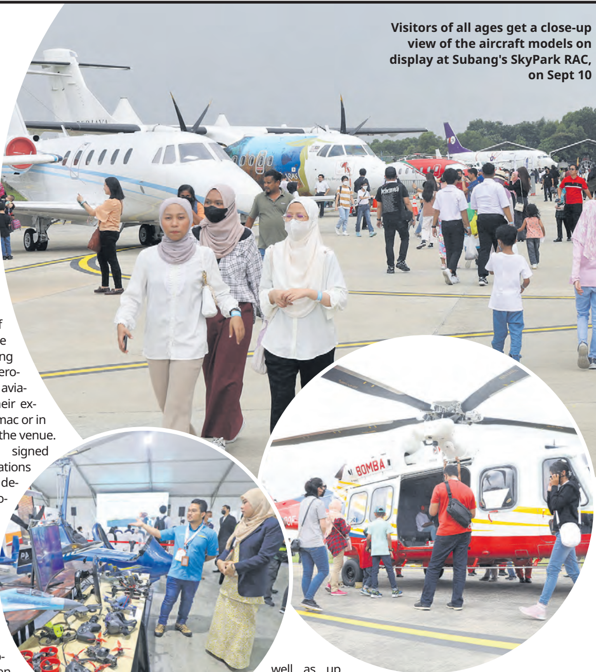
Visitors of all ages get a close-up view of the aircraft models on display at Subang's SkyPark RAC, on Sept 10

"The Sultan Abdul Aziz Shah Airport alone houses up to 19 fixed-wing business aviation and general aviation operators as