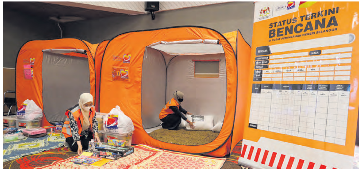
All PPS will be equipped with the basic necessities, as seen in this photo taken during the disaster simulation programme at Dewan Jubli Perak, Shah Alam, on Sept 28

The state is expected to see an average rainfall of between 210 mm and 370 mm in November and December.