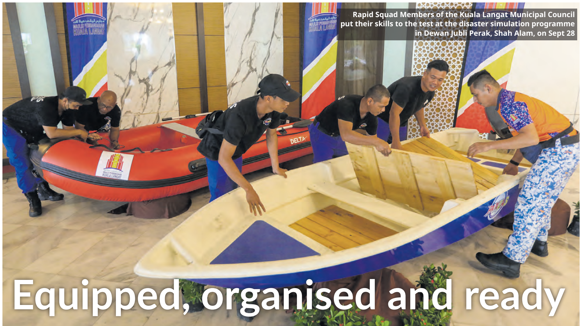
Rapid Squad Members of the Kuala Langat Municipal Council put their skills to the test at the disaster simulation programme in Dewan Jubli Perak, Shah Alam, on Sept 28