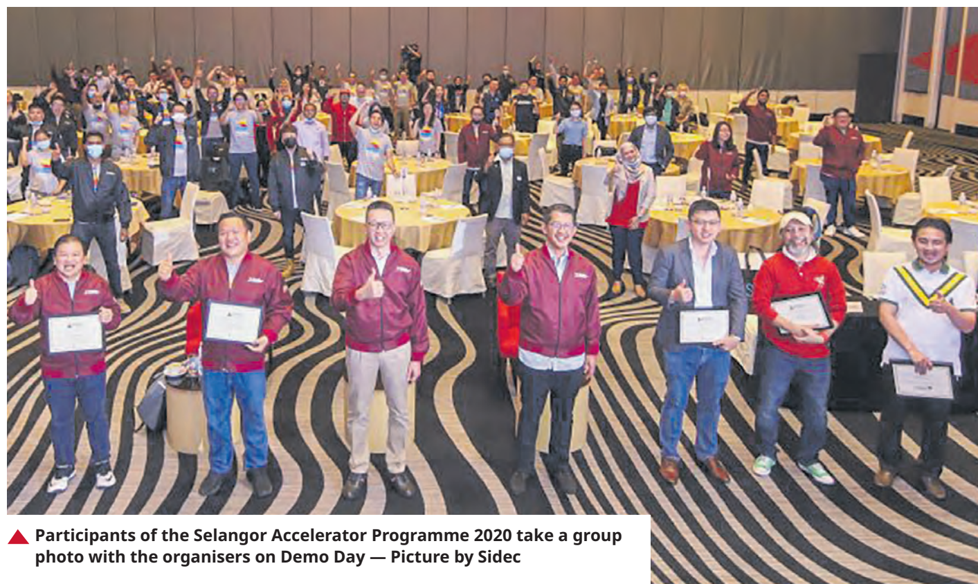
▲ Participants of the Selangor Accelerator Programme 2020 take a group photo with the organisers on Demo Day

It prides itself on disrupting the Malaysian company secretarial landscape. The company was among the Top 5 winners of the Selangor Accelerator Programme (SAP) in 2021, a competition organised by the Selangor Information Technology and Digital Economy