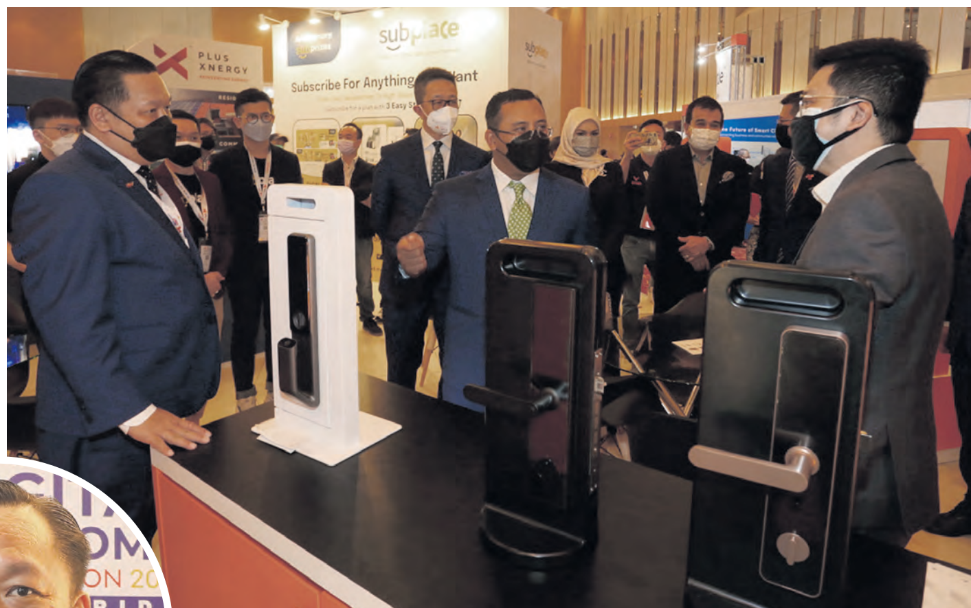
Menteri Besar Dato' Seri Amirudin Shari looks at the exhibits during a walkabout at SIBS 2021 in KLCC

business to become a unicorn, as well as from two soonicorn or "soon-to-be unicorns" Dropee and Commerce.Asia on how to become a soonicorns.