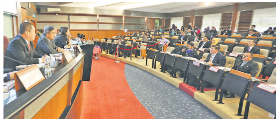
The Selangor Maritime Gateway project aims to spur sustainable social and economic growth on land along 56 kilometres of the river