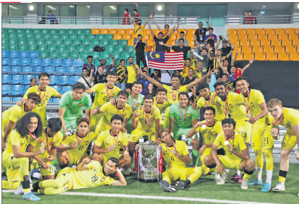
The jubilant Under-22 Squad with the prized cup after their win in Singapore.