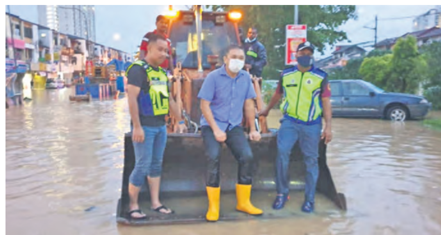
Come rain or shine — or floods — a people's representative must keep on working