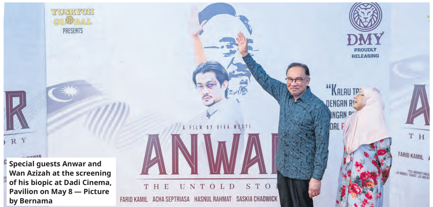
Special guests Anwar and Wan Azizah at the screening of his biopic at Dadi Cinema, Pavilion on May 8

"We will begin by introducing it in factories at the start of May," he said, adding that foreign students and entrepreneurs with business ties overseas will be encouraged to use it too.