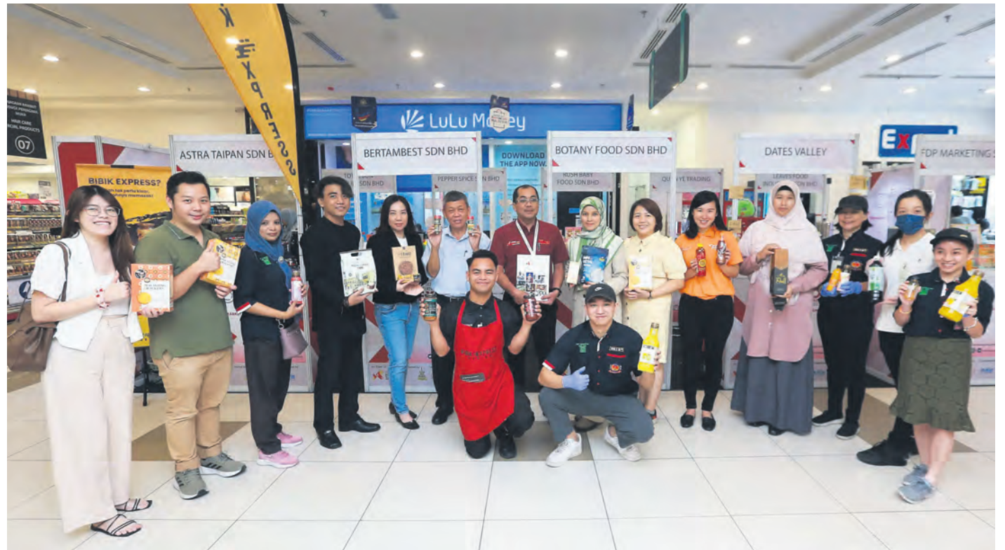
Participants of the SIE Supermarket Buyers Programme at Lulu Hypermarket Capsquare, Kuala Lumpur, which ran for 10 days and ended on May 7

It said that all three retailers will in-