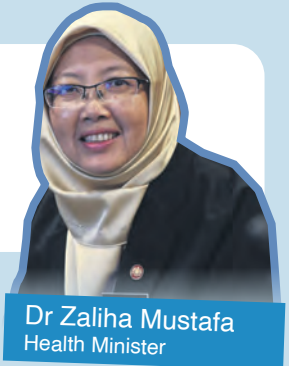
Dr Zaliha Mustafa Health Minister

“ The Health Ministry is looking into giving the Tdap (tetanus, diphtheria and acellular pertussis) vaccine to pregnant women to protect babies from whooping cough, even before birth. ”